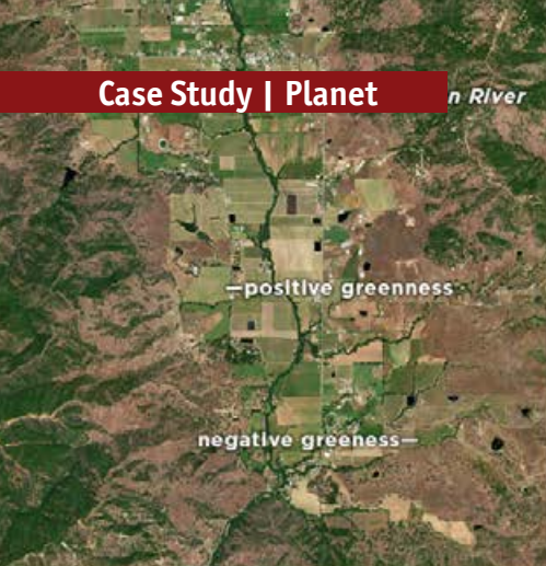
June 8, 2020