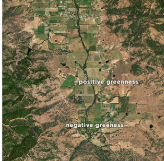
June 6, 2020