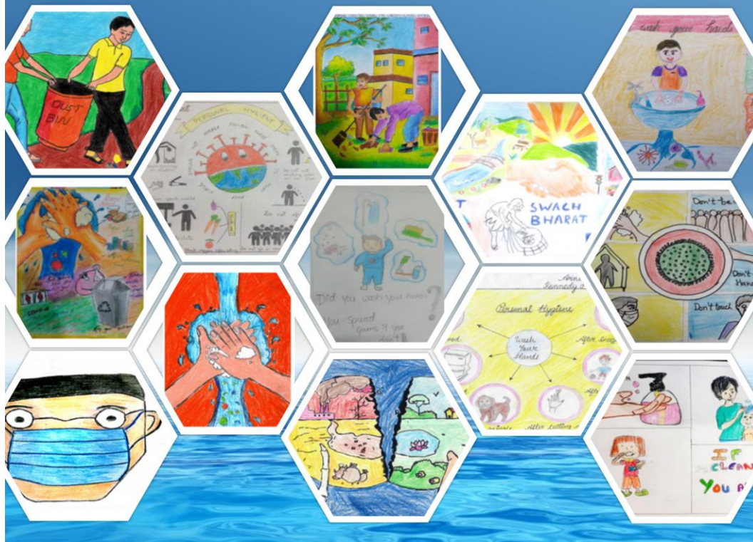
Glimpse of drawings submitted by the students of class 7 & 8 for the competition held on 10 Jul 2020