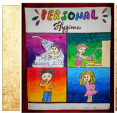
Glimpse of drawings submitted by the students of class 9 & 10 for the competition held on 10 Jul 2020