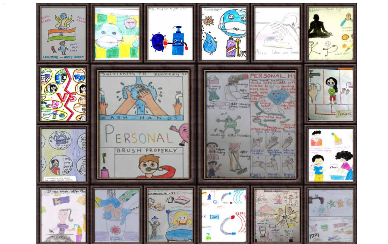
Glimpse of drawings submitted by the students of class 5 & 6 for the competition held on 10 Jul 2020