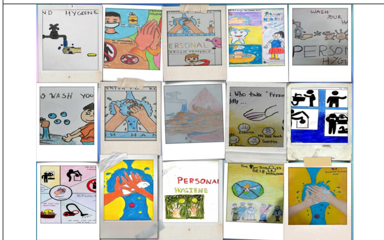
Glimpse of drawings submitted by the students of class 7 & 8 for the competition held on 10 Jul 2020