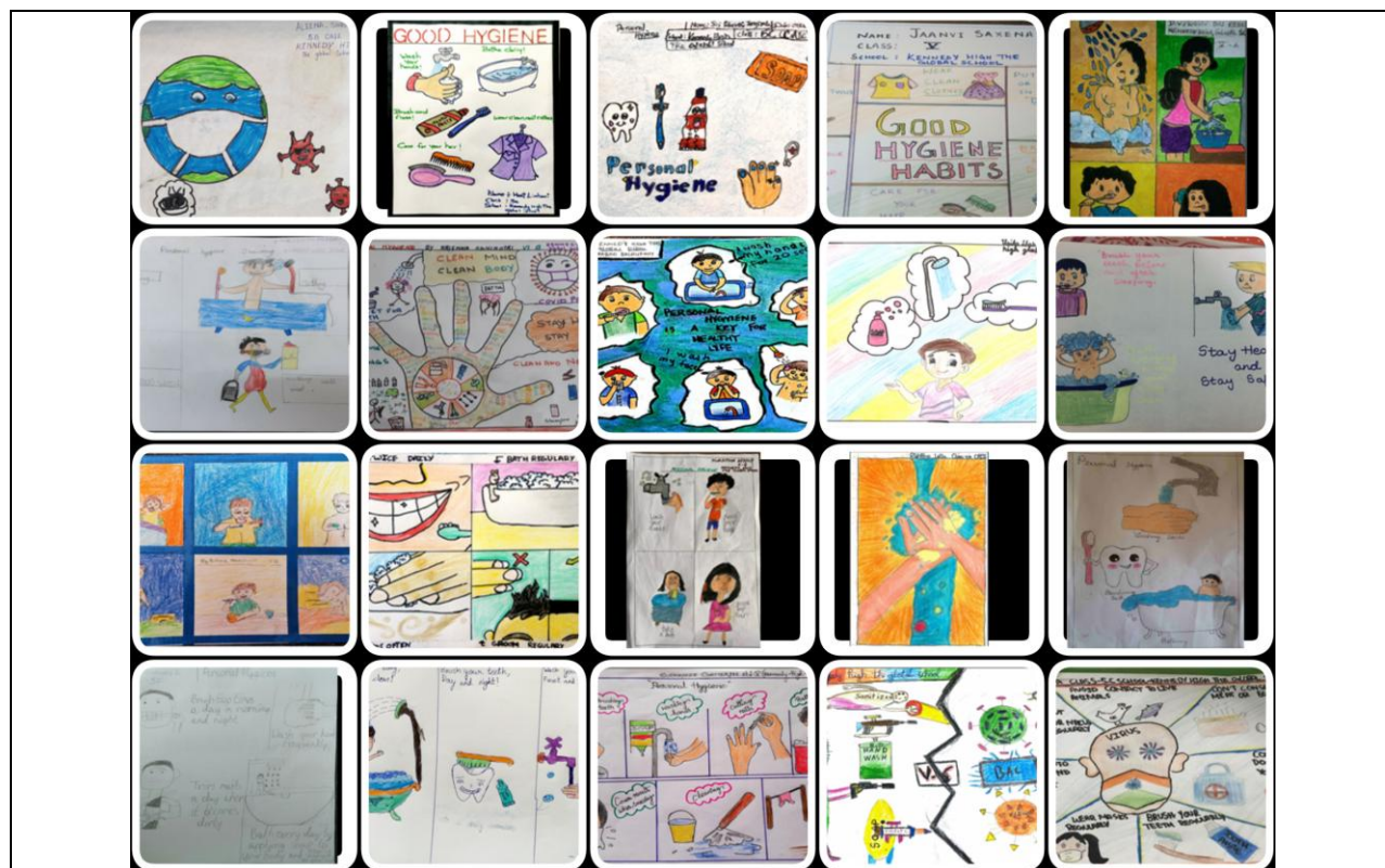
Glimpse of drawings submitted by the students of class 5 & 6 for the competition held on 10 Jul 2020