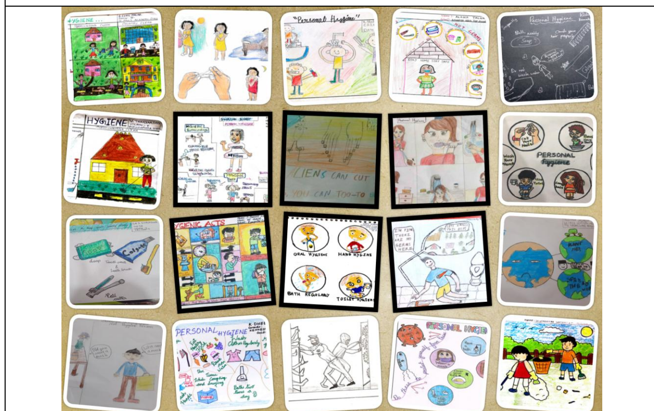
Glimpse of drawings submitted by the students of class 5 & 6 for the competition held on 10 Jul 2020